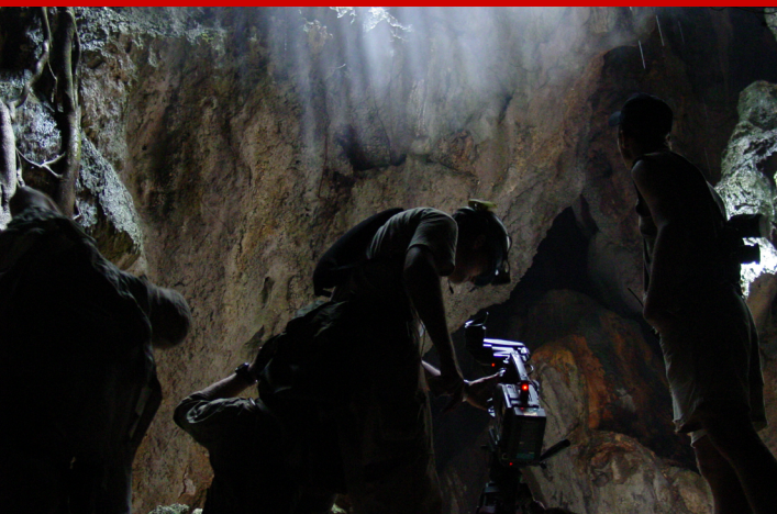
2002 Strix 'Camp Malloy'