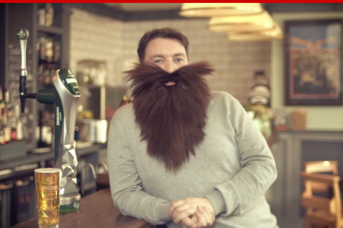
2014 East City Films - Somersby Cider