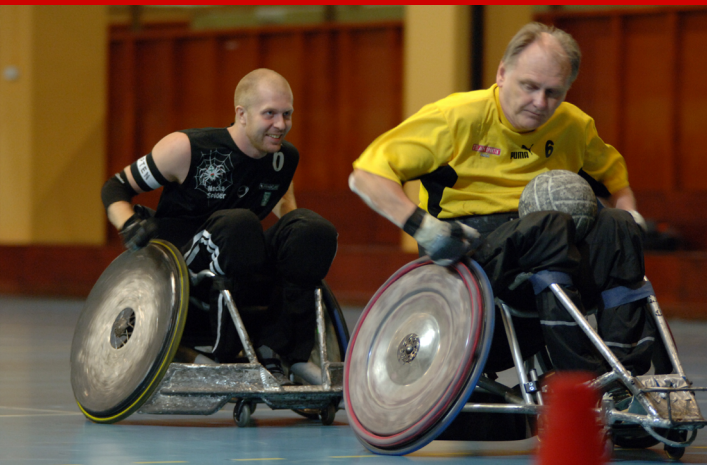
2004 Sarnmark 'Wheelchair Rugby'