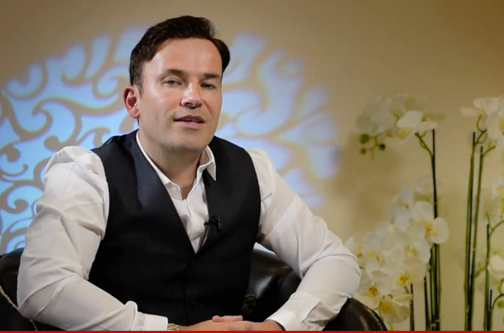
2016 JSP Media Group