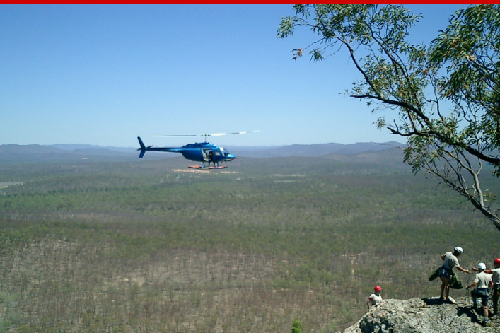
2003 Strix 'Camp Malloy'