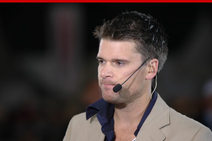
2005 Meter 'Stadskampen'