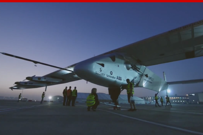
2014 East City Films - Solar Impulse