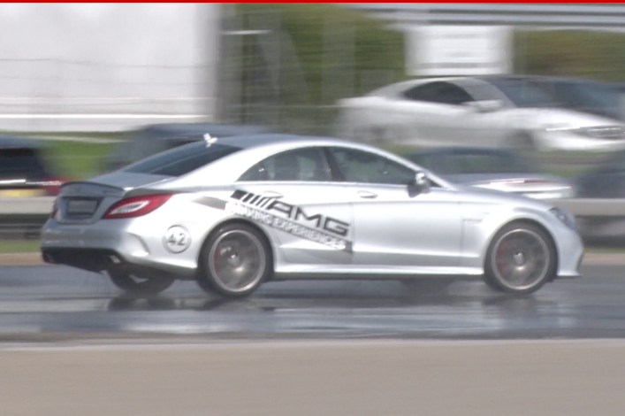
2015 JSP Media - Mercedes Weybridge