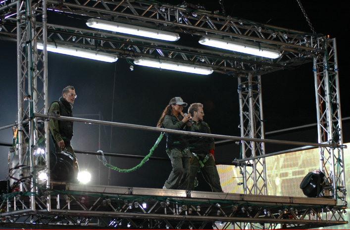
2005 Meter 'Stadskampen'